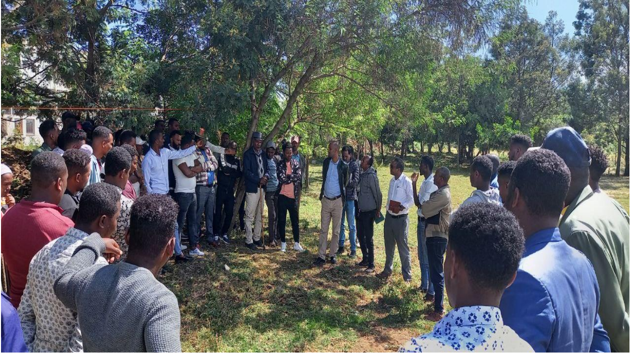
Figure 4: One of the Consultation Meetings held with PAPs

However, most of the consultation meetings held with PAPs ended with disagreement due to the following reasons: