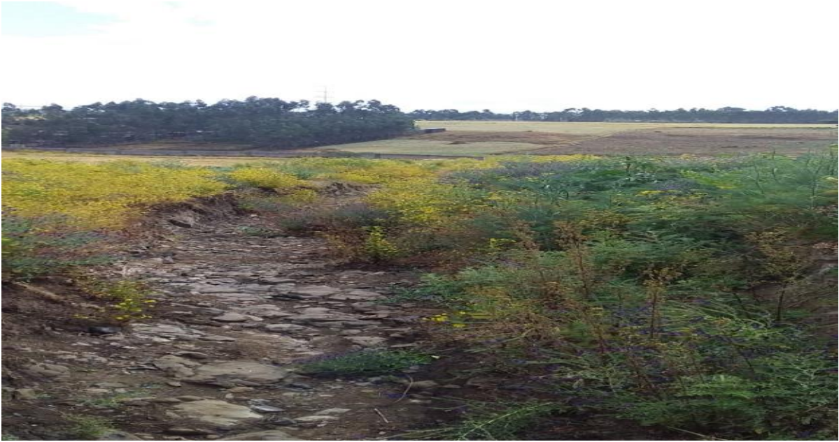
Figure 3: Partial view of the land required for cable trench construction

The required additional land for cable trench construction affects the size of land holdings of six households as the affected land is part of the larger farmland used by PAPs for cultivation of seasonal food crops, such as teff , wheat and peas and a small portion of grazing land.