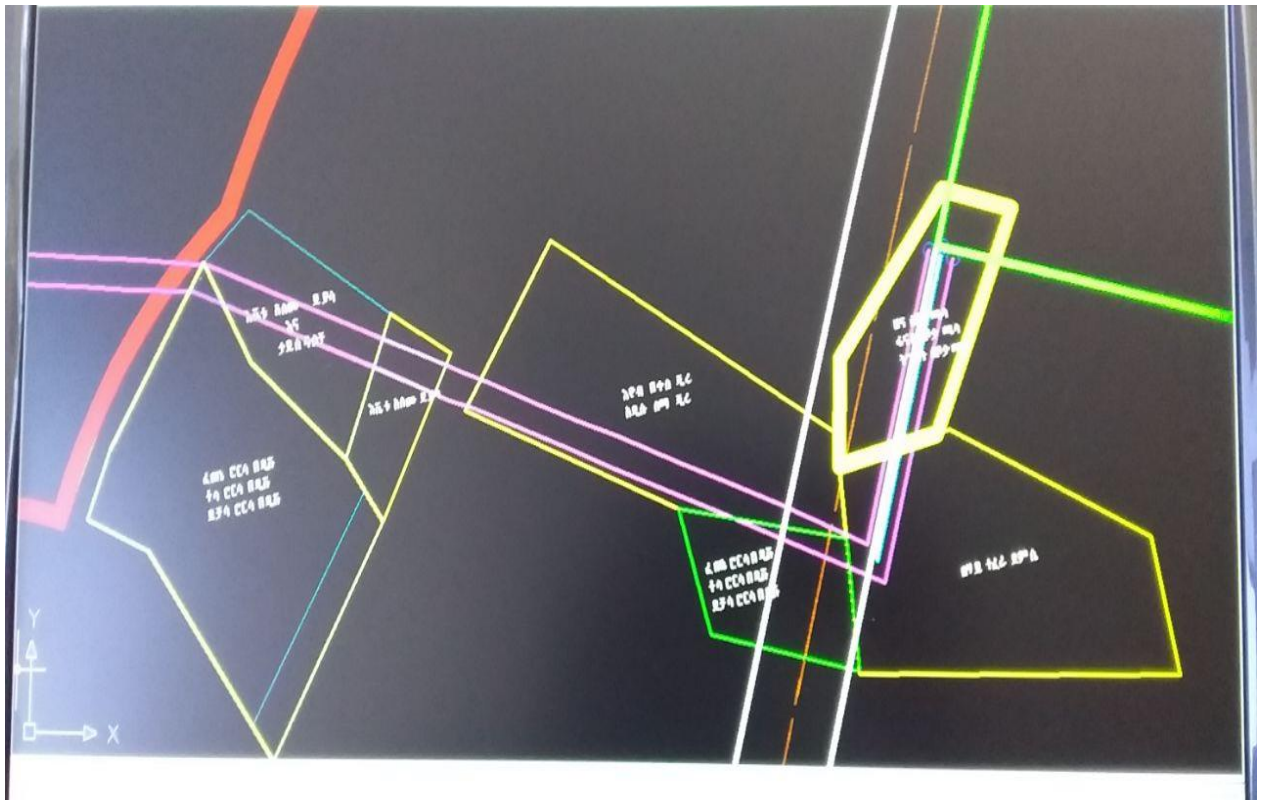
Figure 2: Map of the power trench line and affected lands

The cable trench line passes and crosses through seven plots of farm and grazing lands outside of the BLIP –II boundary. Trench construction is suspended for a long time due to issues related to the size of the RoW clearance area and disagreement of PAPs on compensations rates.